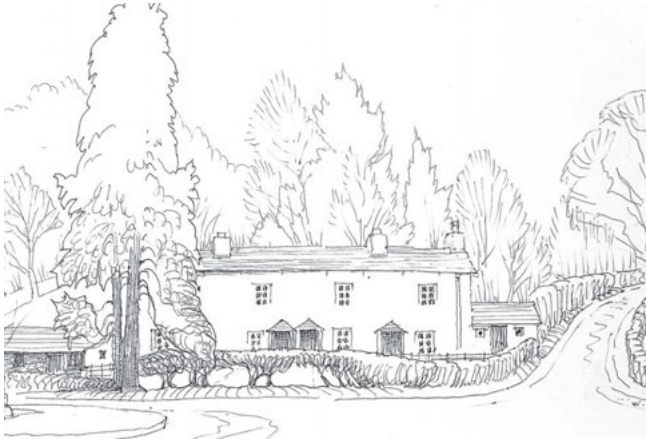
Neam Hurst Langdale

We provide rented homes for local people who cannot afford to buy or rent accommodation at current market prices. Our affordable rents have ensured that many families have been able to stay living in the area where they were raised and now work, keeping communities alive and thriving.