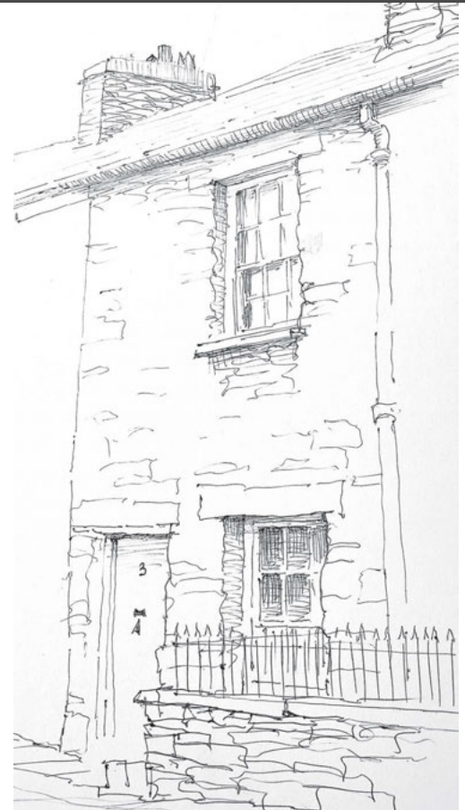
Cottage in Ambleside